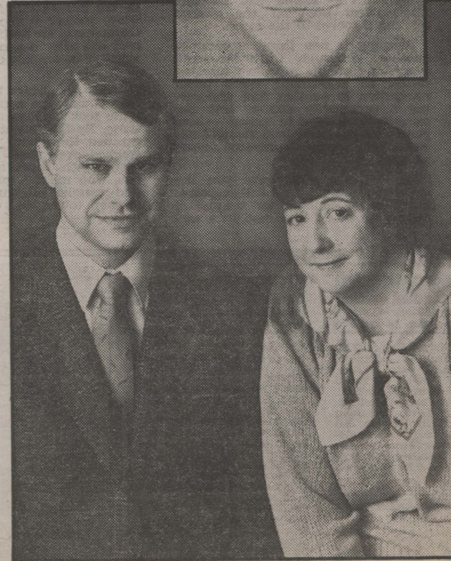
A real space oddity: Author Whitley Strieber (with wife) and inset, the alien who beamed him up as a human guinea-pig for extra-terrestrial research.

Why are they here? Why doesn't Strieber whip his camera out next time they call? Alas, we must wait for the answers.